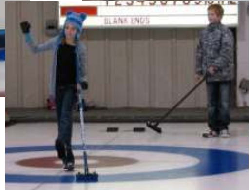
GRADE FIVE CURLERS