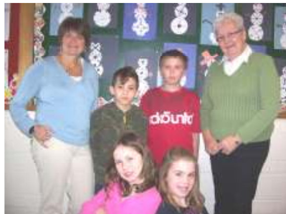
The Hockey Readers