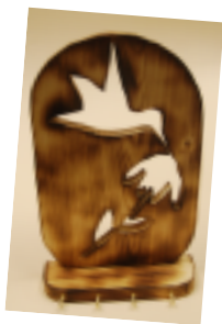
Decorative Key holder by Woody Stich'n