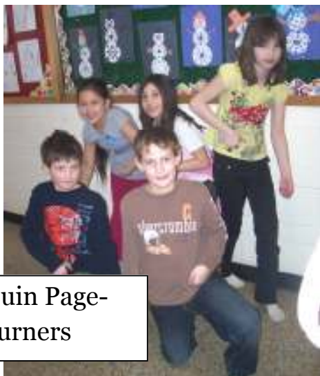
Penguin Page- Turners