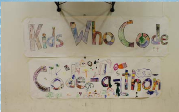
Student-created banner for Kids Who Code Code-a-thon