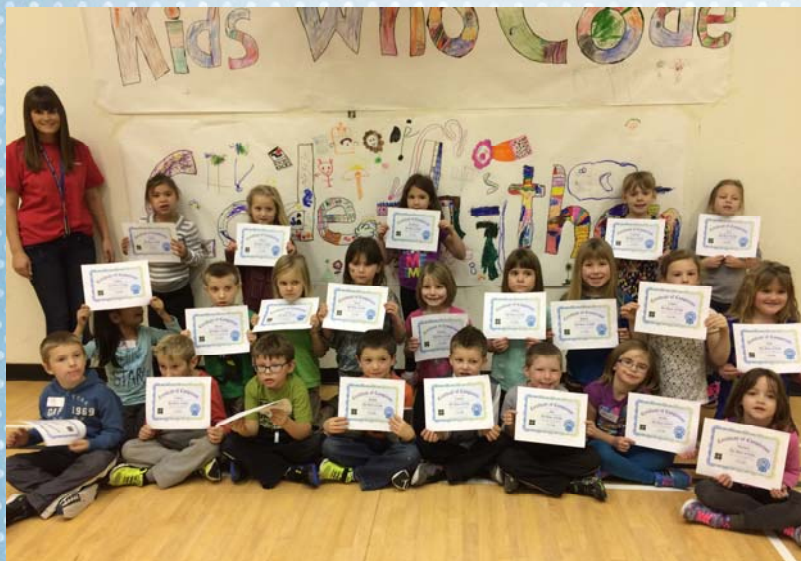
Hamiota Elementary School Grade 1 students receive their Hour of Code certificates.

WE HAD OUR CODE-A-THON. IT WAS FUN! EVERYONE GOT AN HOUR OF CODE CERTIFICATE! WE WERE HAPPY THAT SO MANY PEOPLE CAME. WE HAD FUN TEACHING OTHER PEOPLE.