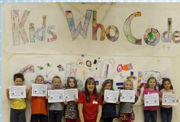
Miniota Kindergarten students receive their Hour of Code certificates at the Kids Who Code Code-a-thon, hosted by HES Grade 1s.